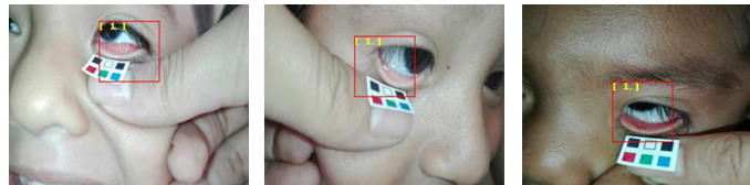
Figure 2: First results of the autimatic conjunctiva detector

The improvement of the system is under development and the final results no prepared, however the initial results are presented in this work and show promising evidence to detect anemia. As explained in the methodology section, the first part of the system is the extraction of the conjunctiva by CNNs. As we can see in the Fig. 2, the implemented CNNs achieve successful results.